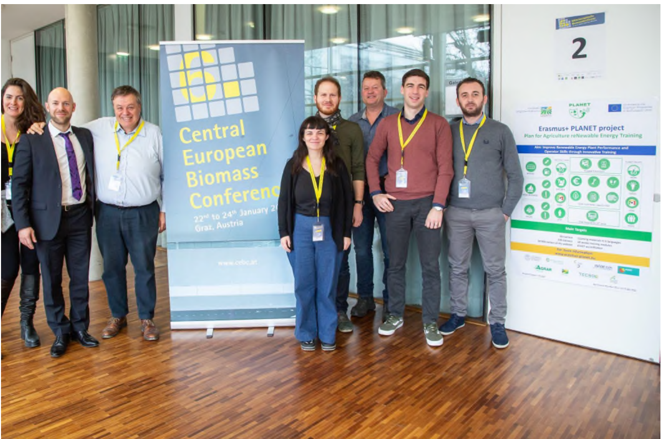
PLANET Meeting at the central european biomass conference