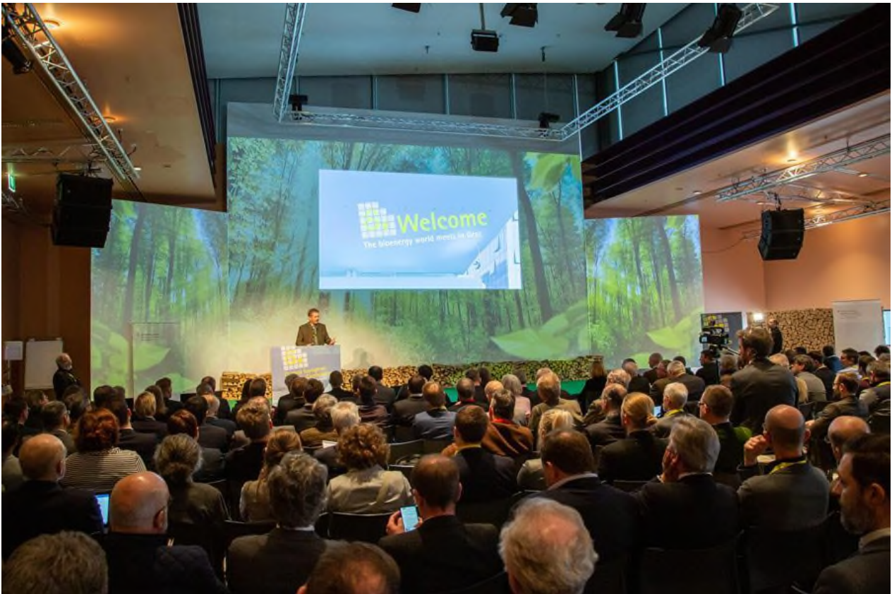
Over 1,500 participants from over 50 nations and all continents.